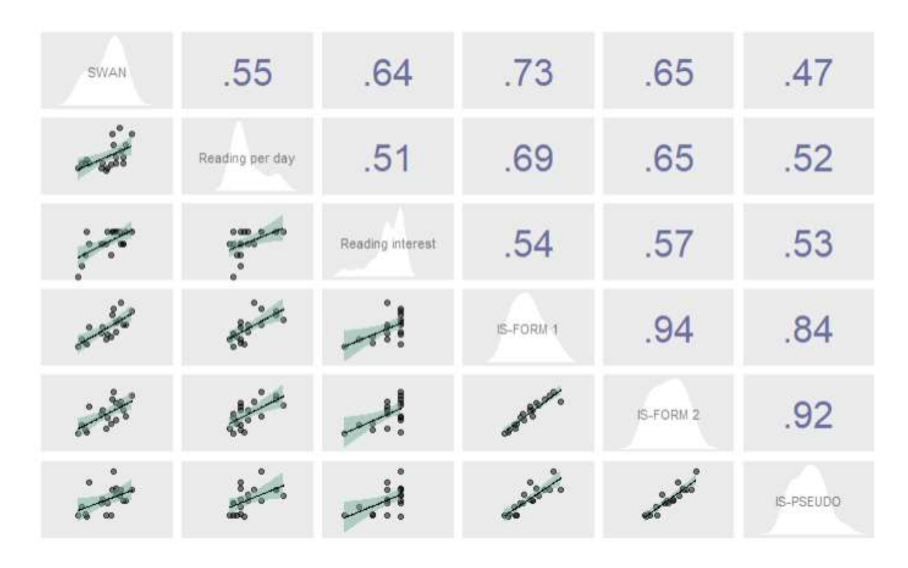
Figure 2. Correlation matrix for SWAN and concurrently assessed reading measures. Upper triangle shows Pearson's r correlation coefficients, lower triangle shows scatterplots with linear fits and 95% confidence bands, and the diagonal shows univariate density plots. All correlation coefficients are significant (alpha level: .05).

they did on the IS-FORM and IS-PSEUDO reading tests. This provides further support for the validity of these lists as measures of children's reading abilities.