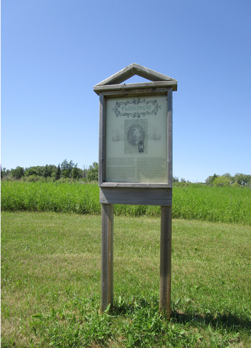
Nelson Gerrard's interpretive sign at Flugumýri, Hecla Island.