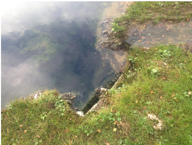
Figure 5. The town of Hveragerði