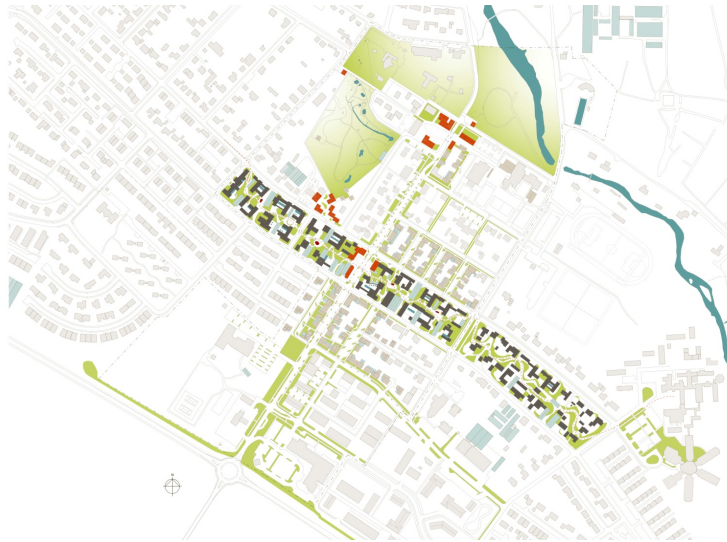
Figure 9. The green strip as an active ground for small and diverse activities (author's drawing).