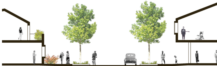
Figure 12: Amphibious Living vision: a section of the road with storm water directly recycled in the street (author's drawing).

The British journalist Anna Minton states that “smaller interventions, on a more human scale, which are based on a wider set of values than the single-minded ideology of increasing property prices, are more likely to bring with them a more diverse and public spirited culture, which is in tune with local people and create more successful places as a result” (Minton, 2009: 198). The architect Nabeel Hamdi, winner of the UN-Habitat Scroll of Honour for his work on Community Action Planning in 1997, states that good planning enhances connections, “it builds on what we’ve got and with it goes to scale” (Hamdi 2006: xviii), it creates opportunities for change, it facilitates emergence: “the ability to organize and become sophisticated, to move from one kind of order to another higher level of order” (ibid.: xvii). It means allowing the beginning of lots of small autonomous projects, but also their coordination into a vision a “common sense of shared purpose” (Layard, 2005: 234) that is at the foundation of each society. Architecture, the art to build cities, must relate with the geography, history and the people of the place, it must work with an economic plan on improving local entrepreneurship, nourish place economies, and develop knowledge, skills, and creativity. Redrawing the rules that produce the space in our city means redrawing ourselves, this is the constant and continuous process at the base of the city making.