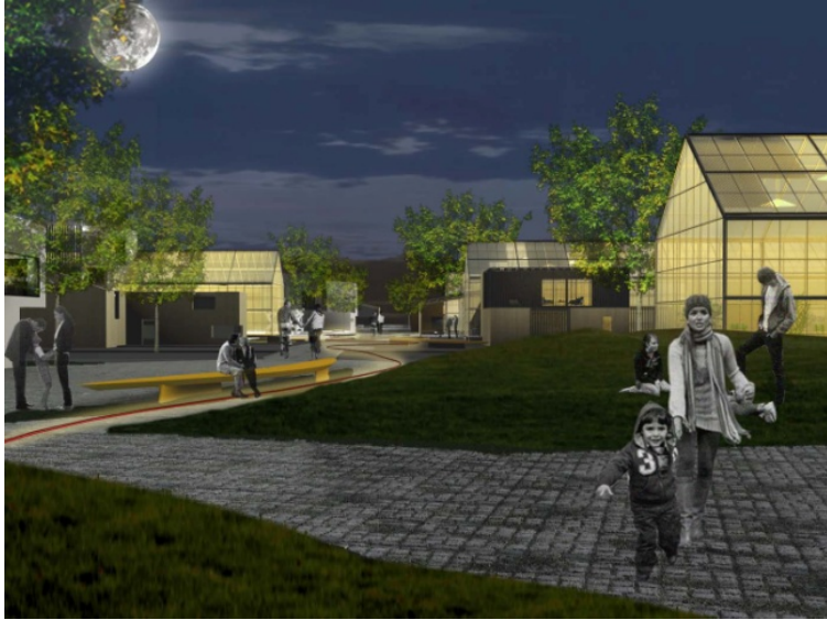
Figure 14: Amphibious Living vision: Hveragerði public space along the Green Strip (author's drawing).