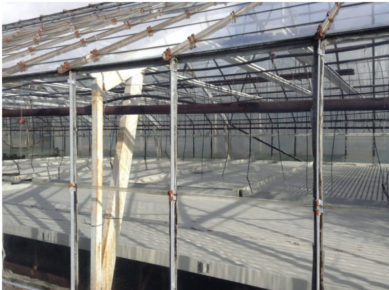
Figure 4. Abandoned greenhouses in the centre of Hveragerði (author's pictures)