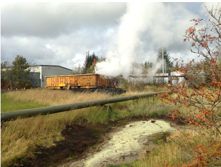
Figure 2. Geothermal water in Hveragerði