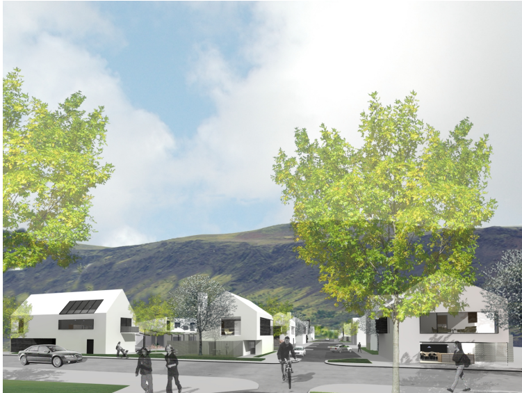
Figure 17: Amphibious Living vision for Hveragerði (author’s drawing).

The American anthropologist Janice Perlman says: “We may have come this far through competition and survival of the fittest, but if we are to make the leap to a sustainable world for the centuries ahead, we will need to be intelligent enough to do it through collaboration and inclusion” (Perlman, 2007: 190).