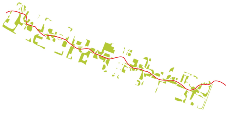
Figure 13: Amphibious Living vision: The Green Strip (author's drawing).