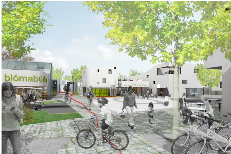
Figure 18: Amphibious Living vision for Hveragerði (author's drawing).

Amphibious Living is a project researched by the architectural office Arkitektur.is. The town of Hveragerði never implemented this project because of lack of funds and because the political stage changed and priorities shifted but its spirit persists as model for better administer local resources and work in closer relationship with the people. Amphibious Living represents a breakthrough in Iceland because it envisions a profound and authentic social revolution for the entire place. A new way of living that is much more in tune with the local resources. The project continues to inspire people who believe that the future of Iceland is not in the hands of big companies with big gestures and grand projects, but it is the hands of each of us, in the small gestures of the individuals.