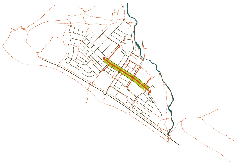
Figure 8. Amphibious Living vision: the green strip reconnects the scattered parts of the town (author's drawing).

In the Amphibious Living scheme, the public space is at the centre of the design and it is celebrated by the small and diverse activities that develop along it. These activities are located in the old abandoned greenhouses forming a strip of approximately 800 long and 100 meters.