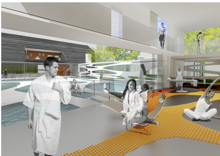
Figure 16: Amphibious Living vision: spas and well-being in Hveragerði (author's drawings).