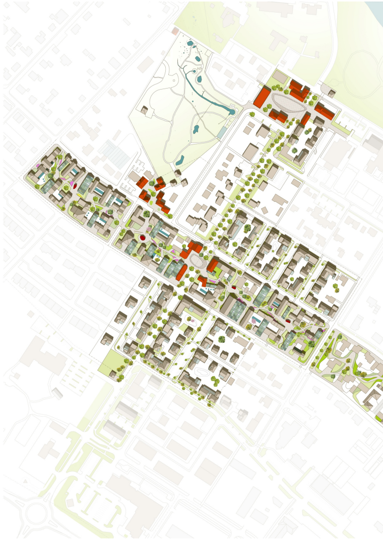
Figure 10. Amphibious Living vision: the centre of Hveragerði (author's drawing).

The core of Hveragerði is imagined to be built up gradually with a series of small-scale independent initiatives started by its own residents or small external investors. Amphibious Living supports the small-scale aspect of the development as fundamental for the success of project.