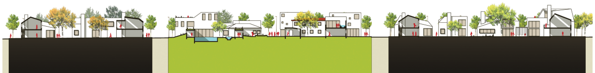
Figure 11. Amphibious Living vision: the small and diverse activities taking place in the Green Strip and adjacent to it (author's drawing).

The core of Hveragerði is imagined to be built up gradually with a series of small-scale independent initiatives started by its own residents or small external investors. Amphibious Living supports the small-scale aspect of the development as fundamental for the success of project.