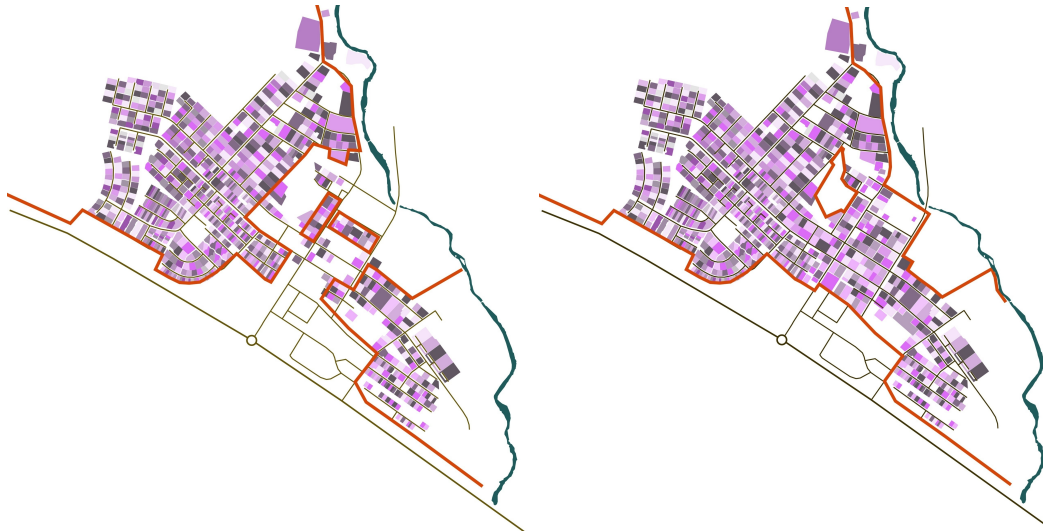
Figure 7. Amphibious Living vision: mapping of activities (what kind of activities?) in purple scale: left as it is today, right as it is envisioned. It is evident that the centre of Hveragerði is emptied by any activities (author's drawings).

In the Amphibious Living scheme, the public space is at the centre of the design and it is celebrated by the small and diverse activities that develop along it. These activities are located in the old abandoned greenhouses forming a strip of approximately 800 long and 100 meters.