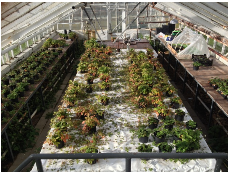
Figure 6. The town of Hveragerði main assets